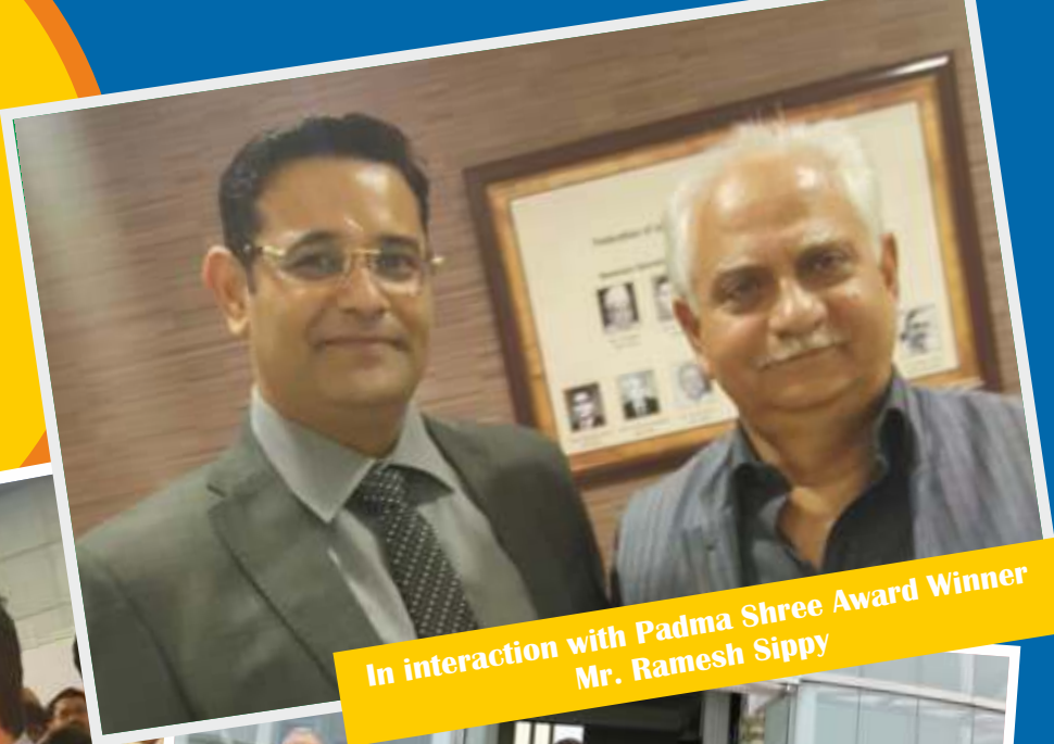
In interaction with Padma Shree Award Winner Mr. Ramesh Sippy