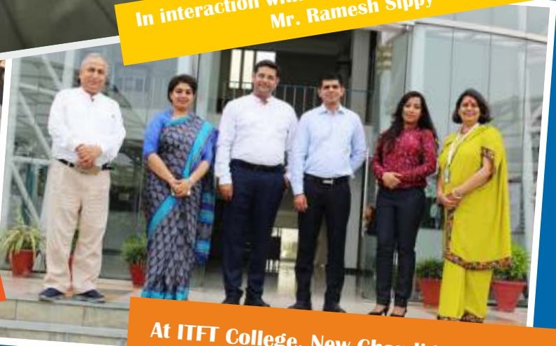
At ITFT College, New Chandigarh Campus