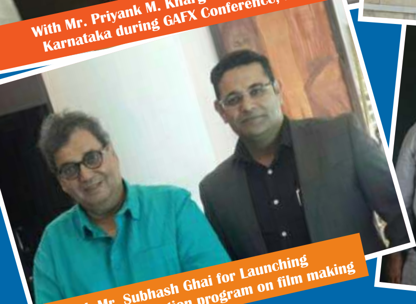
With Mr. Subhash Ghai for Launching short duration foundation program on film making