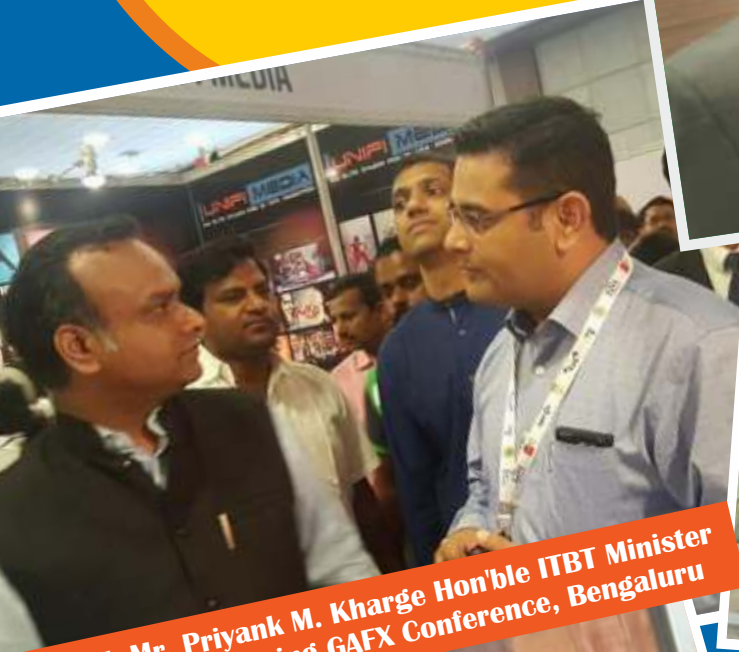
With Mr. Priyank M. Kharge Hon'ble ITBT Minister Karnataka during GAFX Conference, Bengaluru